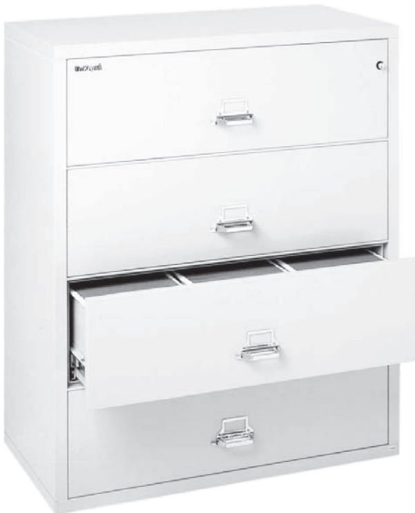
4-4422-C: Four-Drawer 44" Lateral File

Like all FireKing files, these carry FireKing's exclusive 3-Year Warranty on all parts. And our Free Replacement Guarantee: if your FireKing file ever has to protect your records in a fire and any damage occurs to its fire-protection abilities, we'll give you a new one free of charge.